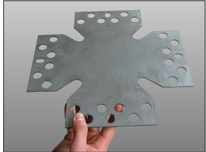
Customized cruciform specimen