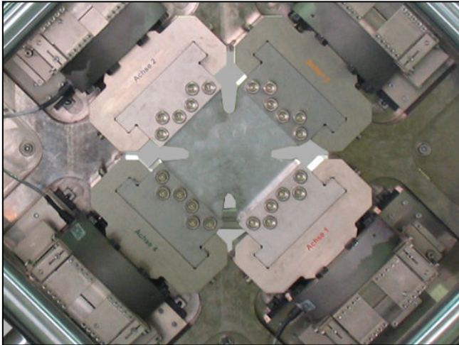
Cruciform specimen installed